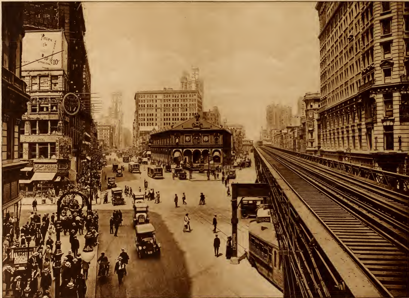
HERALD SQUARE, formed by intersections of Broadway and 6th Avenue. The Herald building, home of the famous newspaper, occupies the center of the square. Large department stores and hotels are on either side, and many theatres, including the Metropolitan Opera House, are in the district. Brilliantly illuminated at night with electric signs.